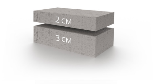
MATERIAL THICKNESS COMPARISON